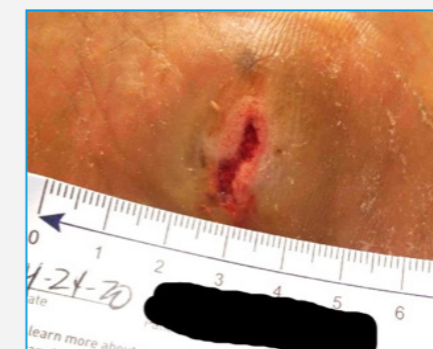
Wound Day 30