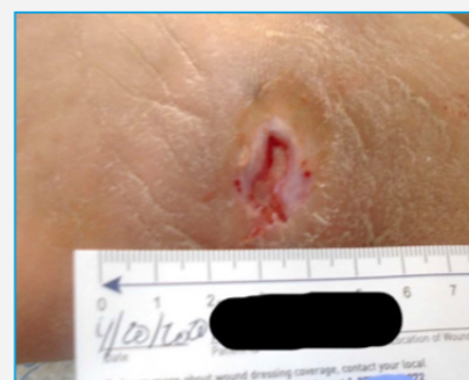
Wound Day 26