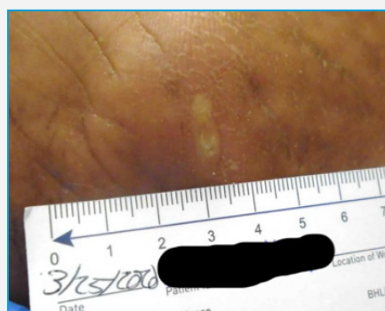
Wound Day 1