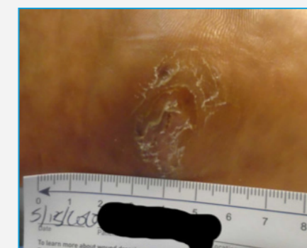
Wound Day 51