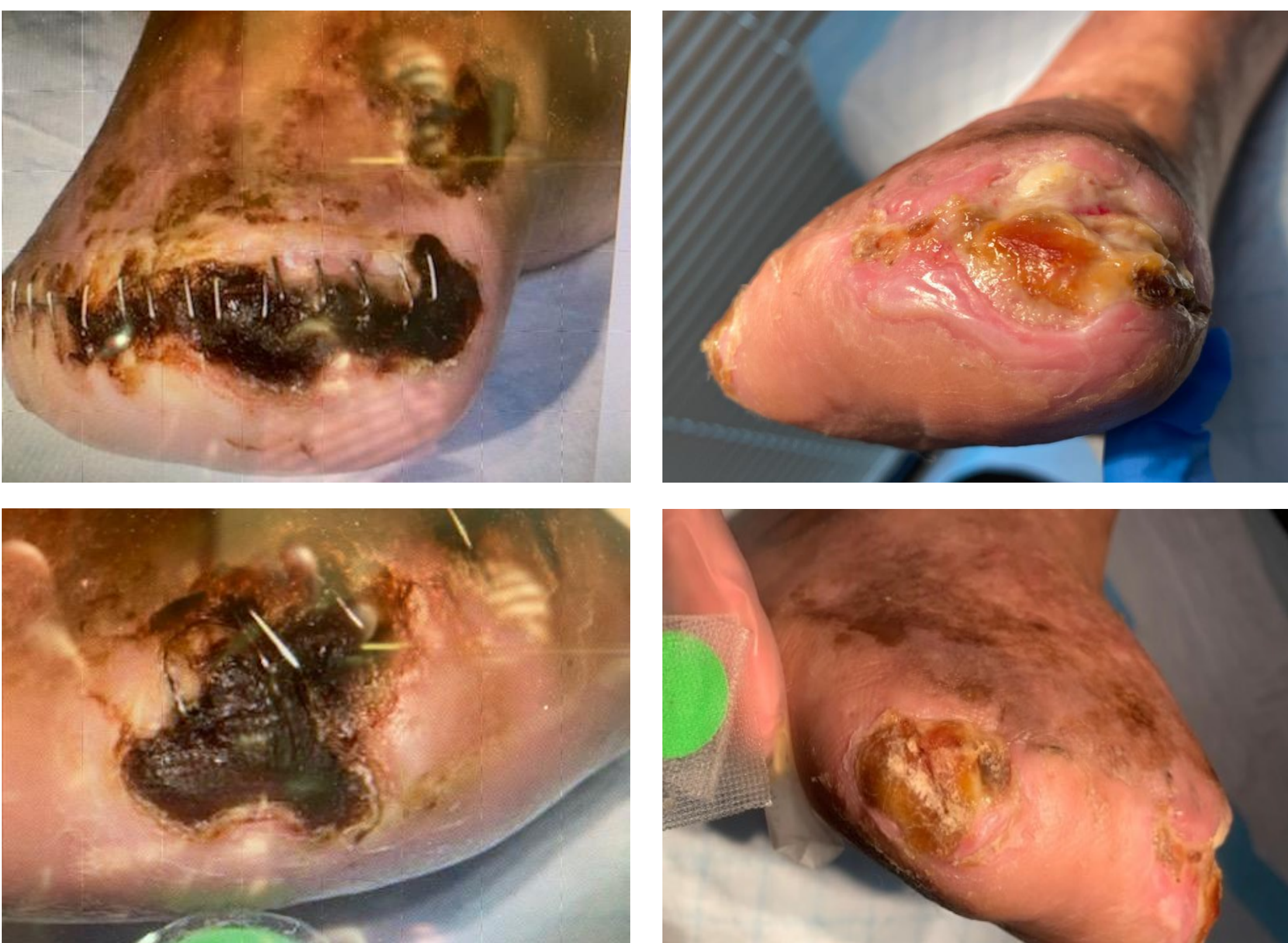
Lower pictures are close-ups of a small section of the wound

76 y/o male with Type 2 diabetes, recent right transmetatarsal amputation, and gangrene on lateral 5 th metatarsal head was offered right leg amputation.